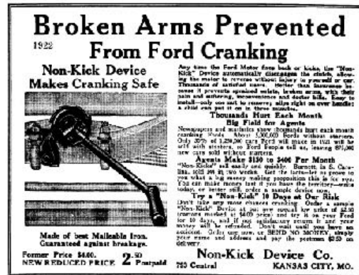
Above: Clymer book, p. 191