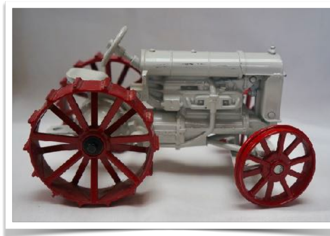
Above: 1919 Ford Fordson Model F die-cast tractor 1:16 gray with red lug wheels, rear hitch, 6 in. Ertl ca. 1989.

Company? In 1916, Henry Ford and his son, Edsel incorporated a new company and they were sole owners. Henry purchased the River Rouge property in Dearborn, MI with personal financing to produce tractors and developed the Ford experimental farm. He moved ahead with his plans to manufacture a Fordson tractor.