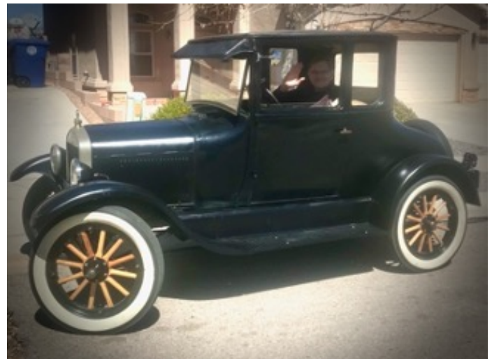
Photo Above: "Arty" the 1927 Model T coupe with Don Neidigk.

My "note-to-self" in all this is that I need to visually inspect all my nuts, bolts and screws often and tighten anything that's loose. Model T's just naturally "shake, rattle and roll" and a lot of parts are going to loosen up. Some of those loose nuts and bolts can fall off causing real danger to the driver, other people on the road, or just leave you stranded if you don't fix them. Also, one doesn't have to have any particular mechanical or electrical skills to fix obvious problems. I'm proof of that!