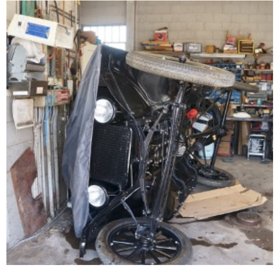
Above: Jim Glover's T on its side after being tipped over by the old in floor lift (round metal plate in floor)