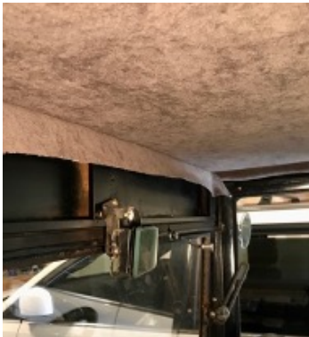
Picture 4 New interior headliner front view