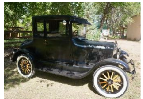
Picture 8: Completed Coupe with new top and interior upholstery at Model T wedding