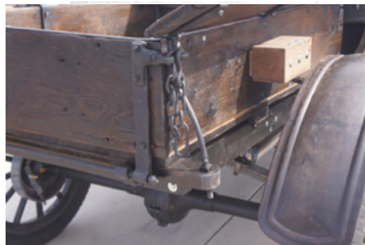
Rear view of the pickup bed showing metal forgings and wood bed. Photo by Paul Duncan, March 2022.

MADE BY THE CLEVELAND HARDWARE CO. CLEVELAND, OHIO