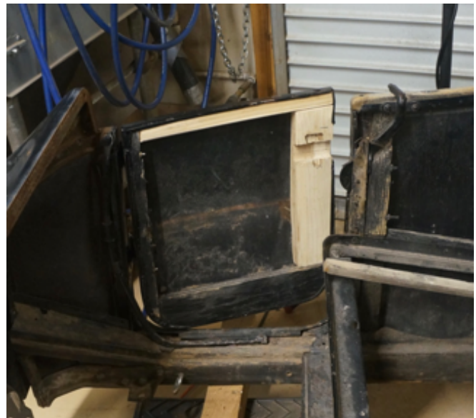
Door with new wood for latch. Photo by Paul Duncan, March 2022.