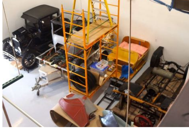
View from the loft to the Shop space: L-R, 1924 Coupe, 1915 Coupelet body; 1909 Touring body; 1909 Tourabout chassis and engine. Photo by Paul Duncan, November, 2021

plenty of room for storage. His "Space" even has a small kitchen and a bathroom with a shower! The shop-level work space has a high newlyinsulated ceiling that could accommodate a future lift, new resin-coated floors, excellent lighting and a huge second floor loft for storage.