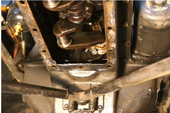
The #4 piston is located back beyond the opening of the inspection plate and difficult to reach.