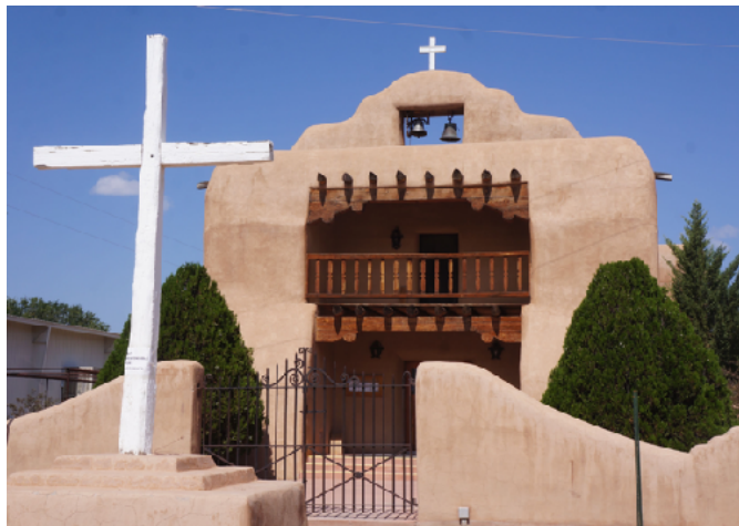
St. Thomas the Apostle church in Abiquiú, NM.