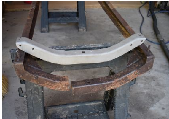
1915/16 frame repair at a recent Work Day

rare parts. These include a driver's side sill plate, a door alignment bracket, an interior door knob, and some zinc door guides. Not being able to look for these items at Chickasha this year, I intend to post photos and a description as "want to buy" on the MTFCA Classifieds. Some of these parts may have been used on other cars and may not be specific to a Ford Coupelet.