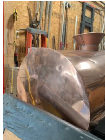
Copper water tank