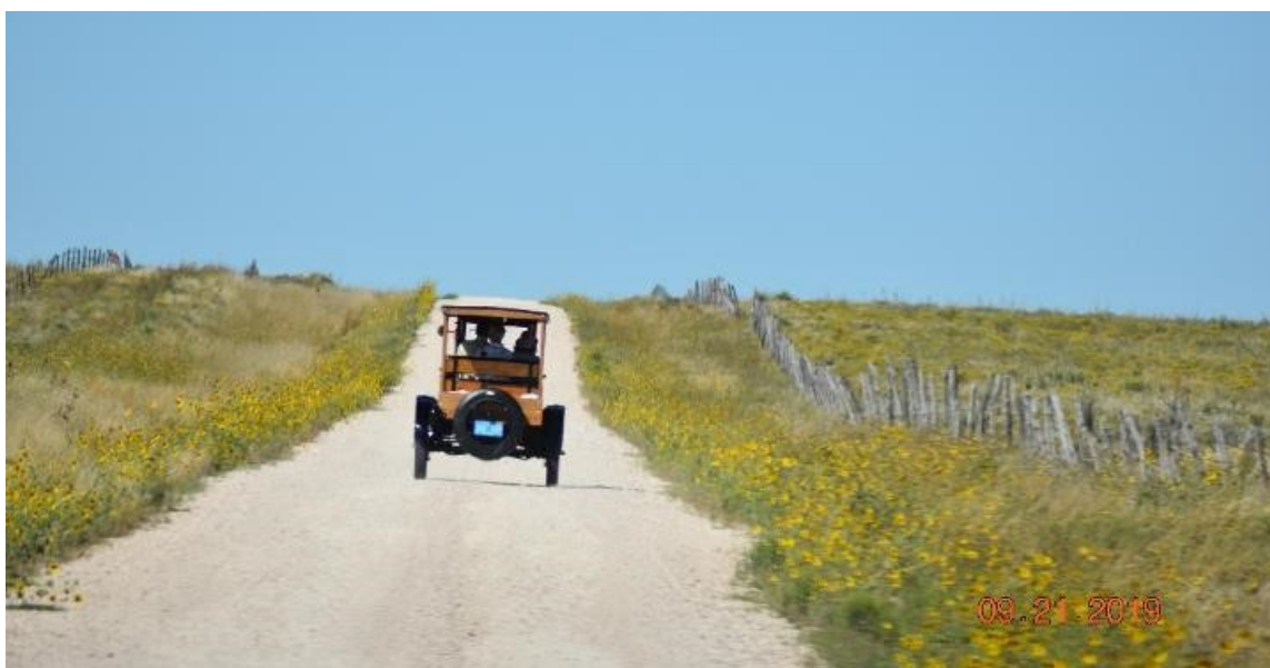
The Landscape category winner is Fran Gurule's photo of our 1918 Depot Hack on the gravel road to Clayton Lake. This road crosses the route of the Santa Fe Trail's Cimarron Cutoff several times and, for several miles, passes through a prairie full of sunflowers. Photo and write up provided by Dave Ferro.