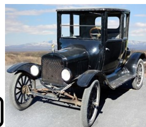
Betty Housholder's 1921 Doctors Coupe