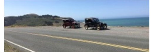
Pacific Coast Highway