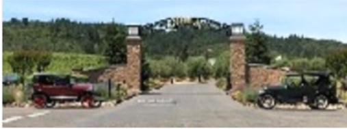
Francis FORD Coppola Winery

Participating in national or regional tours is great reason to join the MTFCA. We have traveled all over the US and to Canada touring in our Model T seeing many wonderful places. If you are not a member of the Model T Ford Club of America, I encourage you to join and see this great land of ours in. There will be tours next year in Sierra Vista, Arizona and Cookeville, Tennessee.