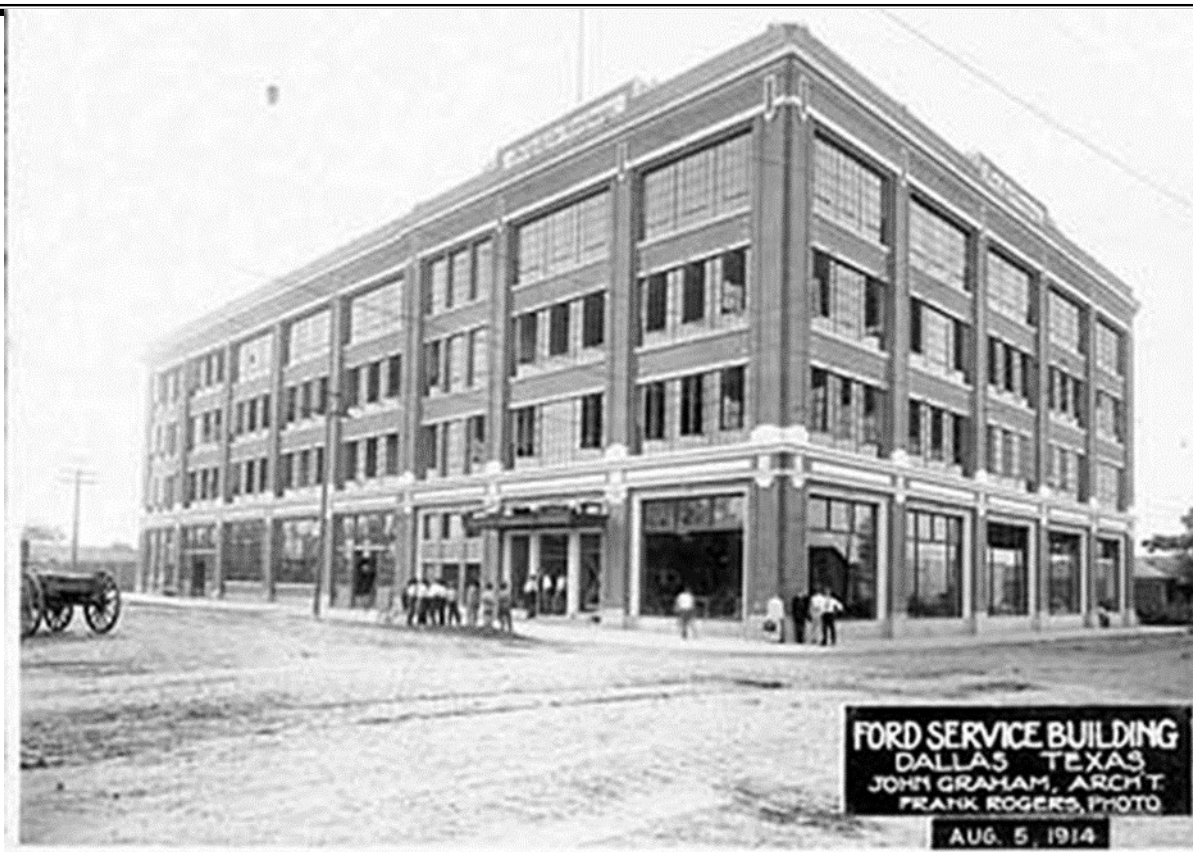
A photo of the Dallas Texas Ford plant where my Model T was assembled in 1914.