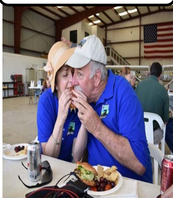
sharing a meal takes on a whole new meaning