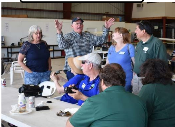
I'm telling you, it was this big.....