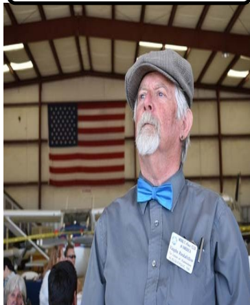
someone is deep in thought