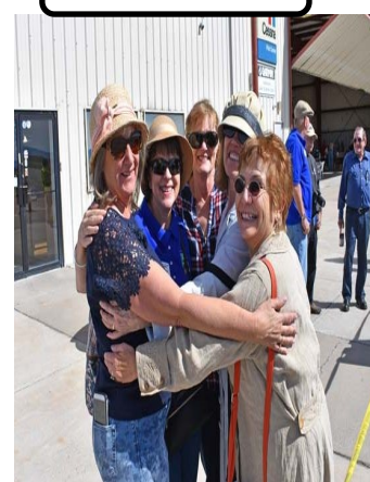
group hug anyone