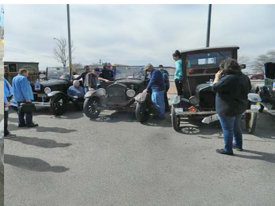
On display @ Rich Ford while working