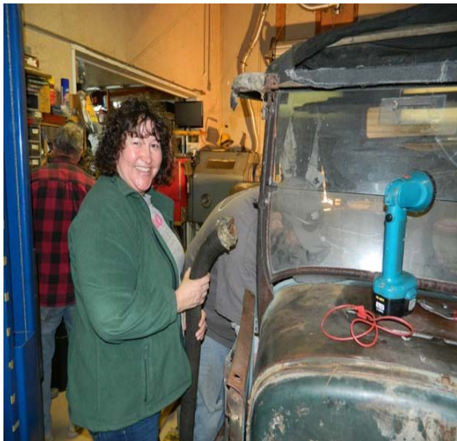
Now I wonder just what she is going to do with that