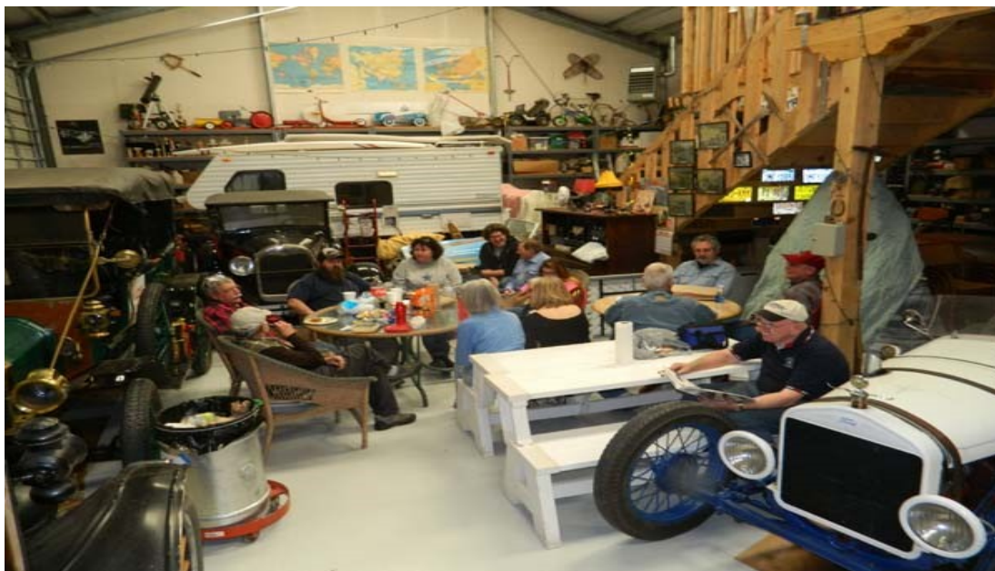
Hey, I thought it was suppose to be a work party.....