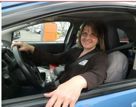
Looks like trouble .....

19 PLAZA LOOP, EDGEWOOD, NM 87015 SALES: 1-800-673-9935 | SERVICE: 1-800-673-9935