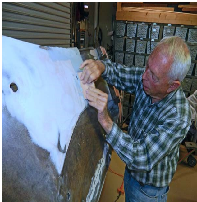
Can anyone guess what Al is doing????