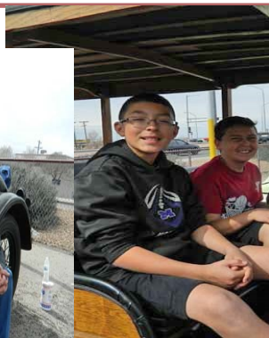
Some future Model T drivers ?????