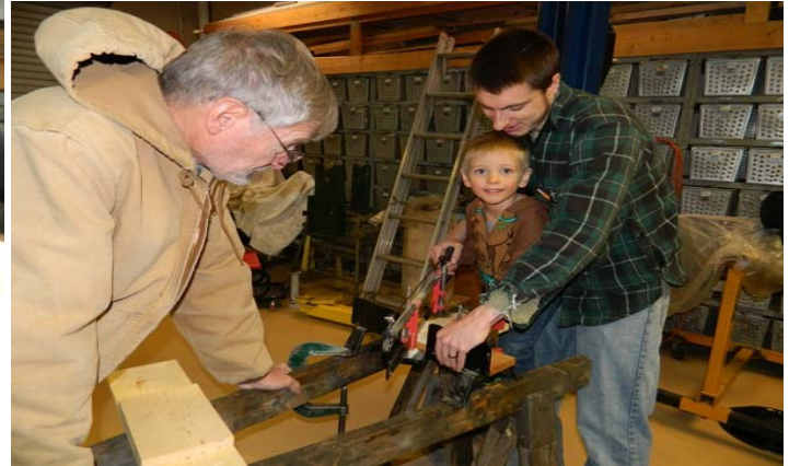
This is what it's all about....getting a younger generation involved (work party 1.7.2017)