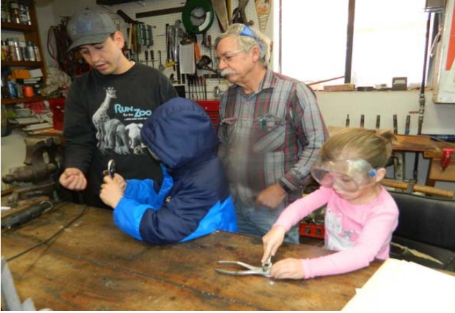
This is what it's all about....getting a younger generation involved (work party 1.21.2017)