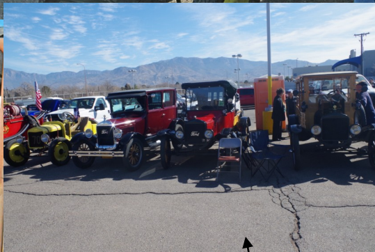
Lined up Model Ts