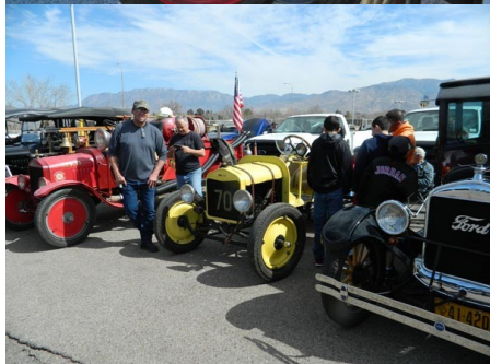
Our cars lined up