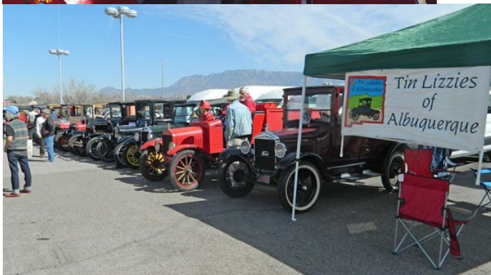
Shade was a necessity from the hot sun