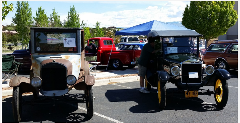
Peterson's and Dominguez' cars on display