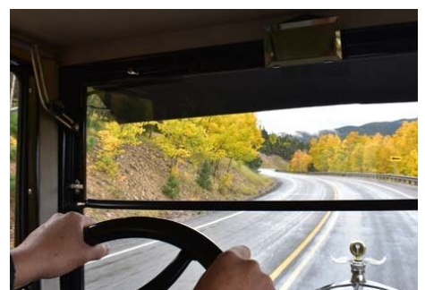
T's on Taos Plaza, taking a break on Bobcat Pass and driving from Red River to Eagle Nest