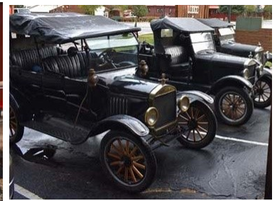
Some of the T's parked around the grounds of the lodge.